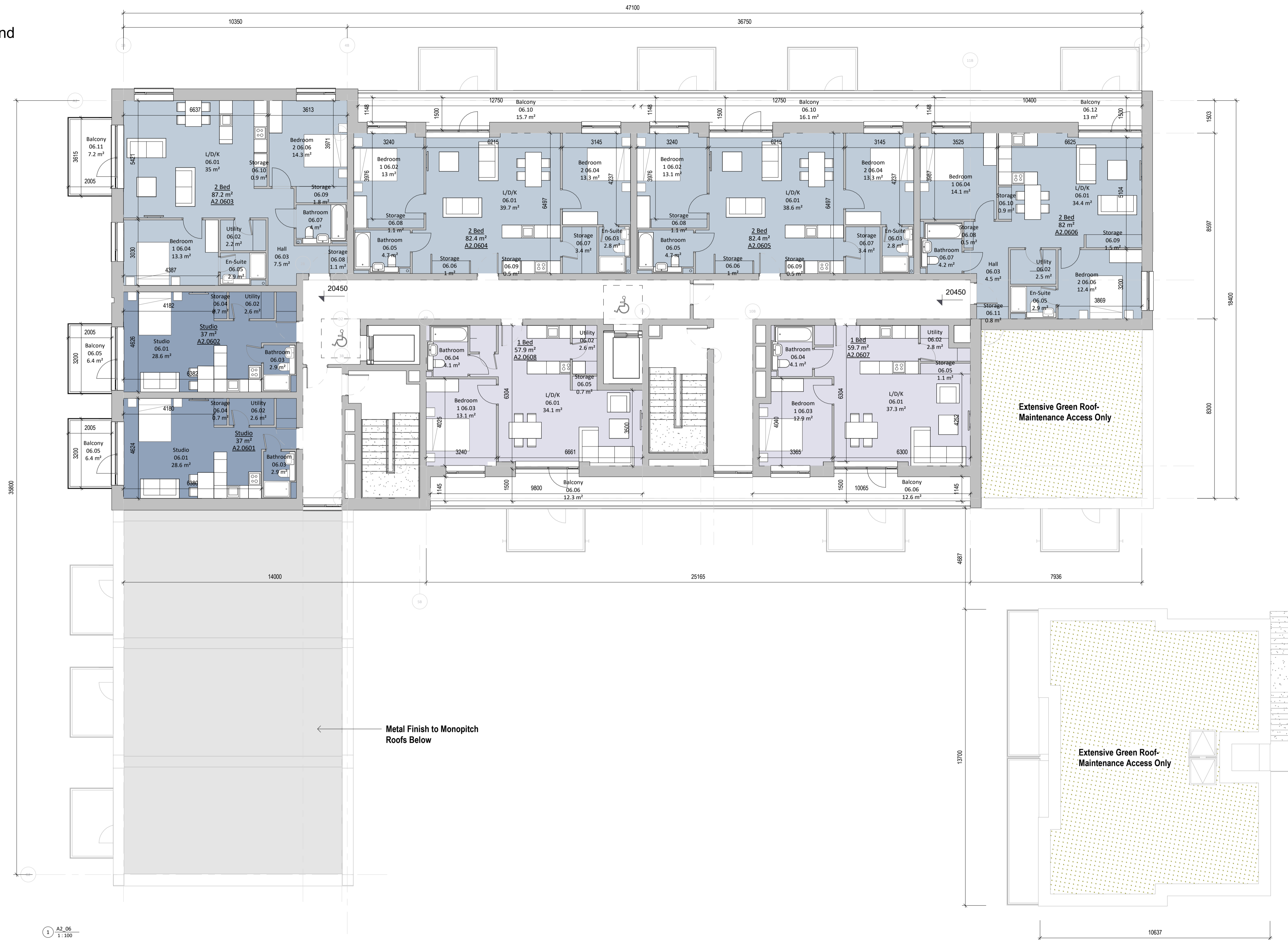
Block A2_Level 06